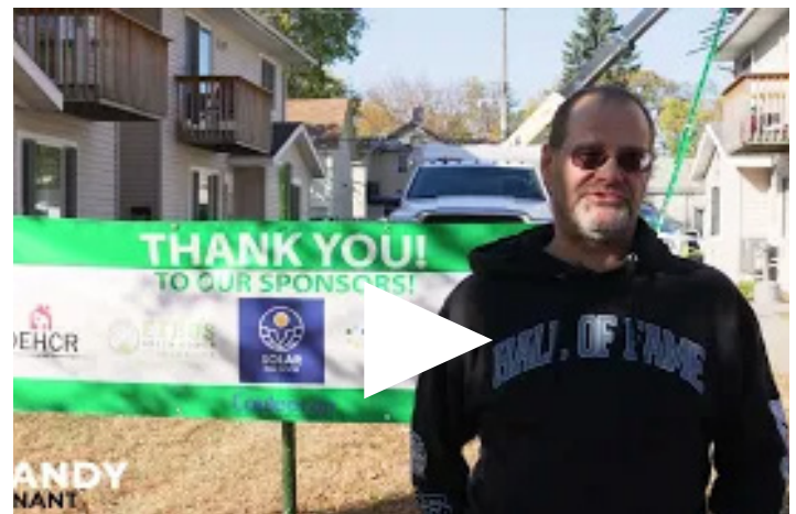
Check out our Solar Project video!