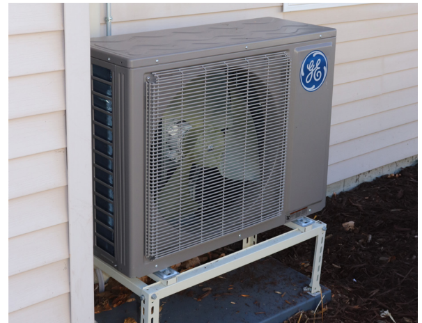
Air source heat pump technology will reduce energy costs for low-income households in Wisconsin.