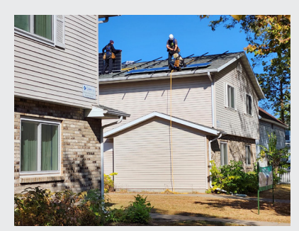
The Renew Wisconsin Solar for Good program donated the solar panels for the project. This grant will help Couleecap residents gain access to clean, renewable energy and allow them to save money on their utility bills.