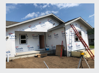
Units are being sold to incomeeligible buyers in Crawford County.