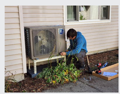
Our new pilot project integrates solar and air source heat pumps into existing weatherization programs to further reduce energy costs for lowincome households in Wisconsin.

Couleecap is working with the State of Wisconsin and funding partners to build a model that can be scaled statewide.