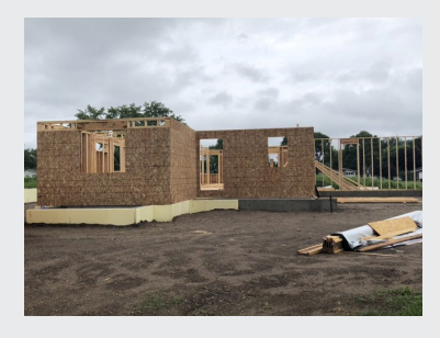
Couleecap built 4 units of workforce housing in Prairie du Chien.