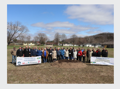
Ground breaking event brings together the community.