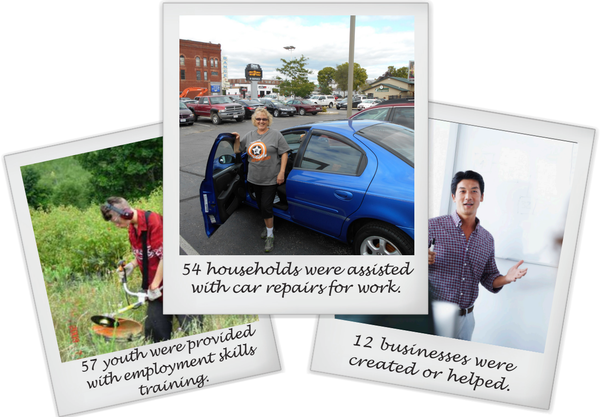
54 households were assisted with car repairs for work.

Coulecap offers programs that focus on employment, business creation, and transportation to get to work. These programs help increase the income and economic self-sufficiency of working poor households by helping them acquire new skills, needed transportation, or start businesses.