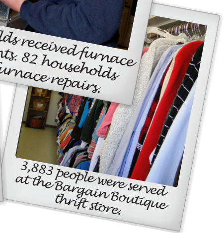
3,883 people were served at the Bargain Boutique thrift store.

“I want to thank you for the energy assistance. Without your help I wouldn’t have been able to pay my bills on time.”