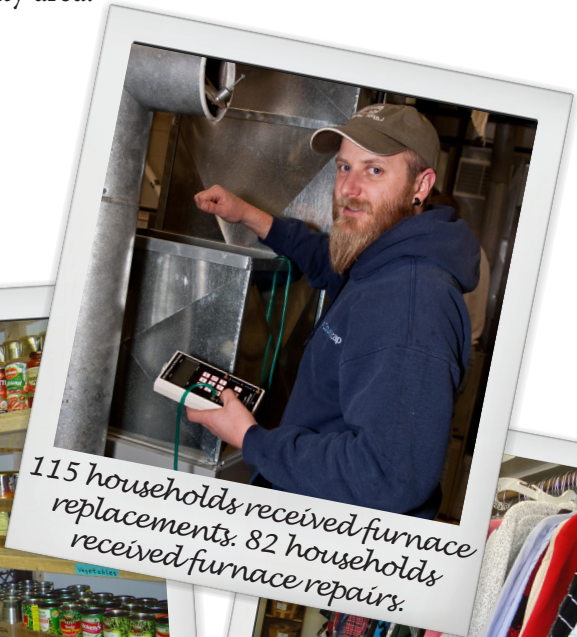
115 households received furnace replacements. 82 households received furnace repairs.