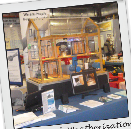
Couleecap's Weatherization program at the Vernon County Fair.

“My only hope is to someday be able to pay it forward and instill the gratitude to those around us and “do unto others.”