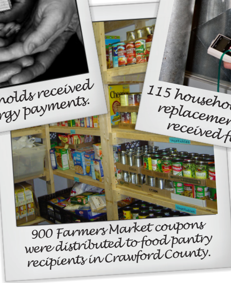
900 Farmers Market coupons were distributed to food pantry recipients in Crawford County.