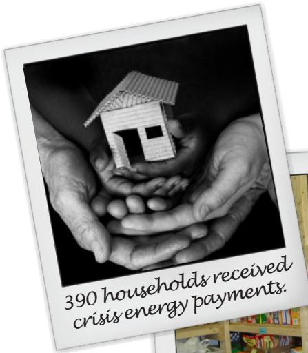
390 households received crisis energy payments.

Coulecap offers programs that focus on helping individuals and families in need of emergency utility payment assistance, food, clothing, and more. The Emergency Food Assistance Program (TEFAP) provides food to pantries, meal sites, and shelters. Coulecap acts as an Emergency Food Organization handling the distribution of TEFAP food to eleven pantries in the four county area.