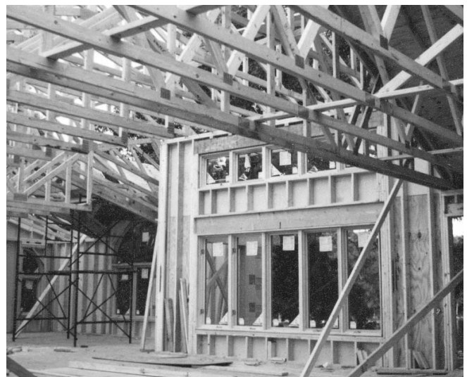
Stick-frame house during construction. Later, wall and ceiling cavities will be sealed and insulated.

Floors or walls that are located above or next to unheated spaces, such as crawl spaces, can also be insulated. Converting an unheated basement into a heated, insulated living space can help eliminate heat loss from ductwork and reduce the risk of freezing water pipes. In addition, a properly dehumidified, insulated basement can decrease condensation, which can help prevent mold and mildew.