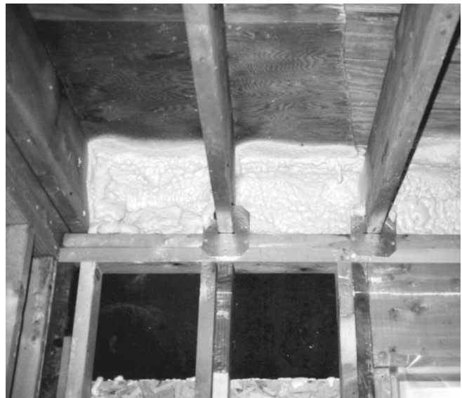
Insulating the sill box with spray-in foam.

Insulation is the material installed in your attic, walls, and other “cavity” areas to prevent or slow the transfer of heat from one area to another (see diagram on page 3). Heat travels toward cooler areas. In winter, for instance, heat will move toward an attic or unheated garage. The process also works in reverse. During hot summer months, hot air trapped in an attic can warm the cooler air in the rooms