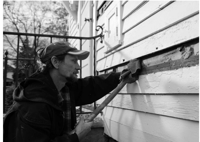
Installing sidewall blow-in insulation.

Here's the problem: cold air leaking into your home can make the basement and main floor difficult to heat, even