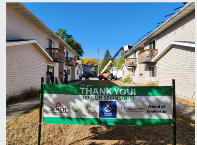
The project is funded by the Wisconsin Department of Administration, Renew Wisconsin Solar for Good, Focus on Energy, Ethos Green Power Cooperative, and a Friend of Couleecap.