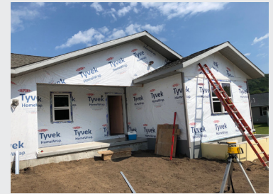
Units are being sold to income-eligible buyers in Crawford County.