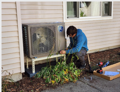
Our new pilot project integrates solar and air source heat pumps into existing weatherization programs to further reduce energy costs for low-income households in Wisconsin.

Couleecap is working with the State of Wisconsin and funding partners to build a model that can be scaled statewide.