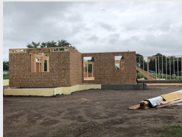
Couleecap built 4 units of workforce housing in Prairie du Chien.