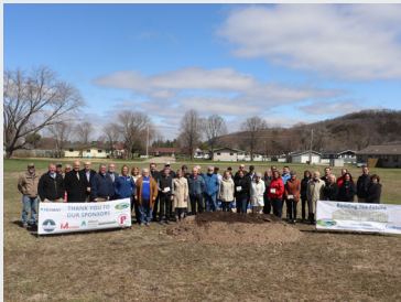
Ground breaking event brings together the community.