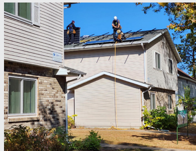
The Renew Wisconsin Solar for Good program donated the solar panels for the project. This grant will help Couleecap residents gain access to clean, renewable energy and allow them to save money on their utility bills.